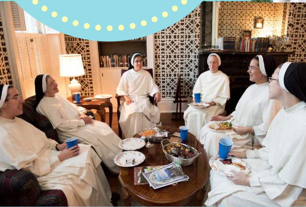
Left: Supper that evening was with our sisters at St. James Parish in Elizabethtown.