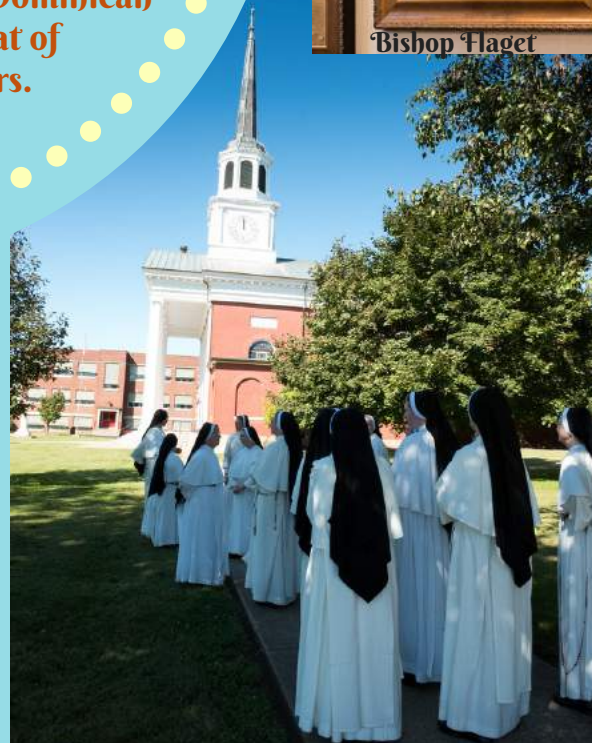
St. Joseph's Proto-Cathedral, Bardstown