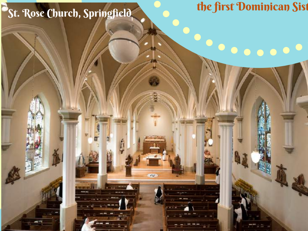
St. Rose Church, Springfield