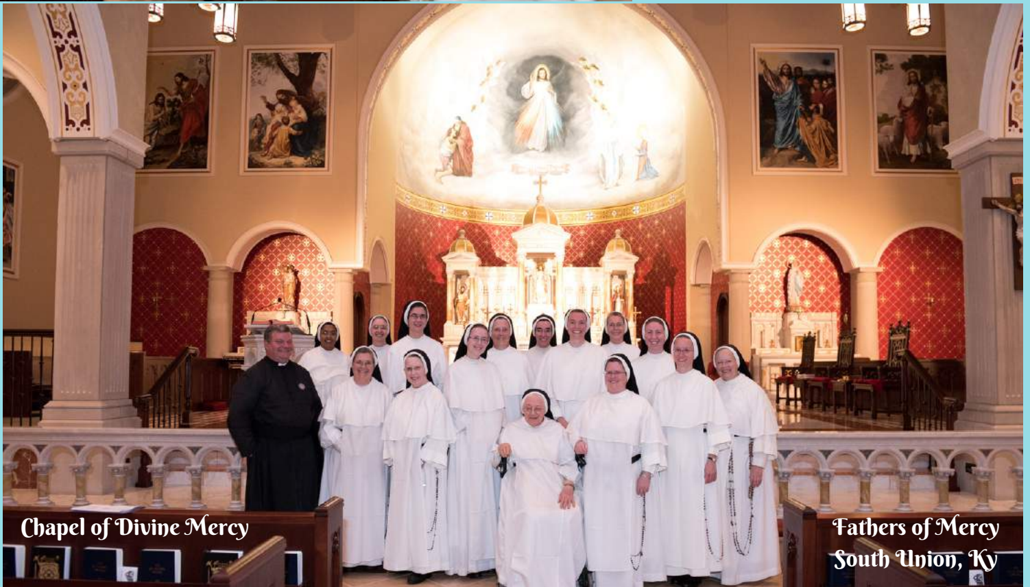
Chapel of Divine Mercy