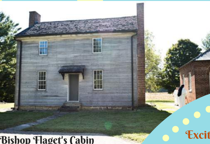
Bishop Flaget's Cabin