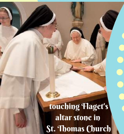
touching Flaget's altar stone in St. Thomas Church

Excited about community's new mission in Elizabethtown, Kentucky, a group of 24 sisters made a pilgrimage on October 7 to some of the Catholic Church's historic sites in our neighboring state. We visited the two-story log cabin of Bishop Joseph Flaget, first bishop west of the Appalachian Mountains. Its poverty was in contrast to the beauty of St. Joseph's Church, his first cathedral, built down the road in Bardstown. Next, in nearby Springfield we made our way to the site of the beginnings of Dominican life in America: St. Rose, the first foundation of Dominican friars, and St. Catharine that of the first Dominican Sisters.