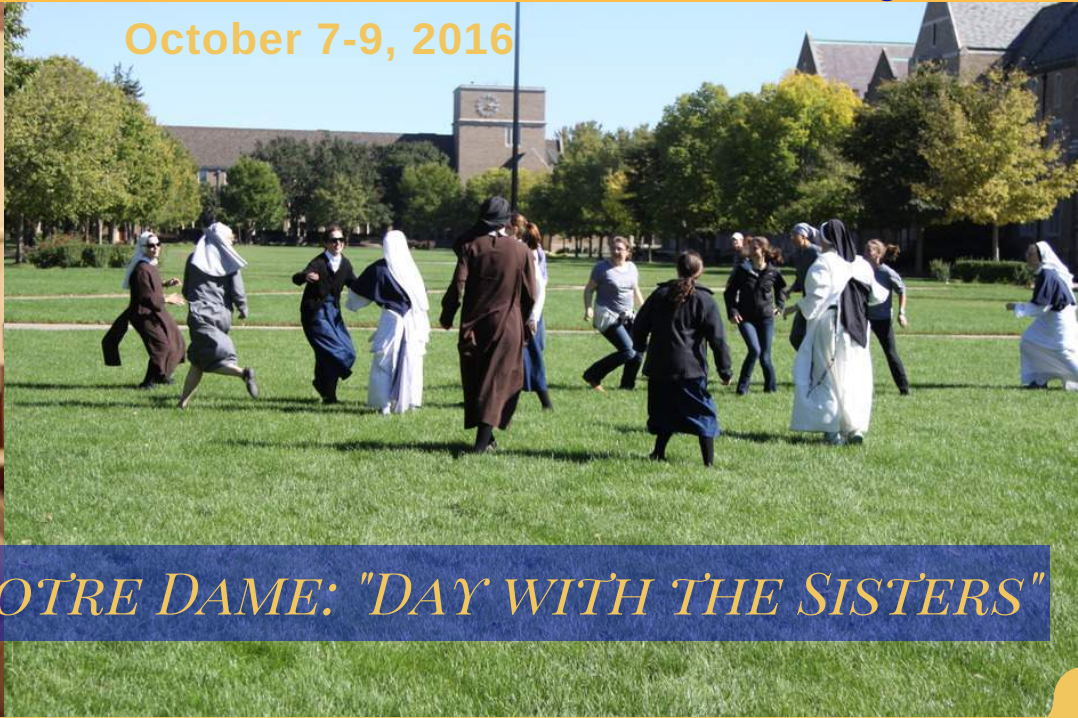
NOTRE DAME: "DAY WITH THE SISTERS"