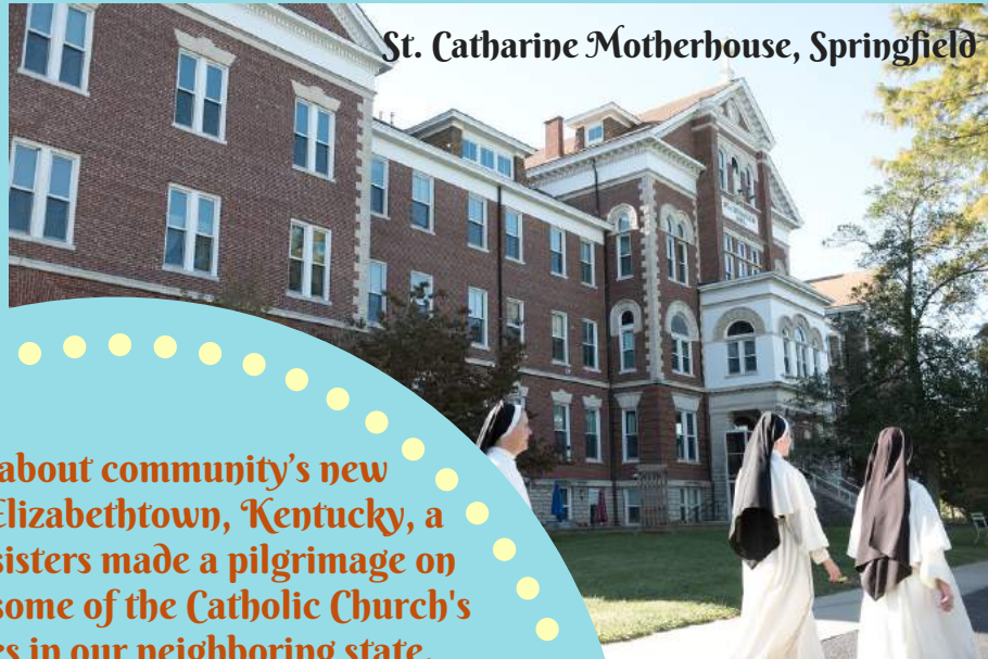
St. Catharine Motherhouse, Springfield