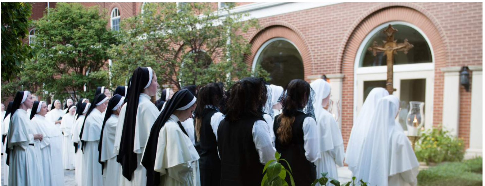
Praying the rosary before a statue of Our Lady in our cloistered garden, during the Rosary Procession.