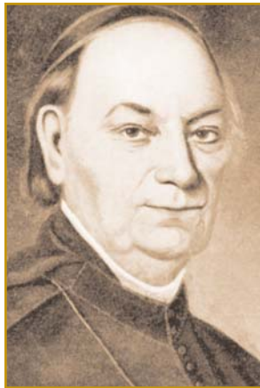
The Most Reverend Richard Pius Miles, O.P. Nashville's Founding Bishop

At St. Cecilia, Home is much on our minds these days, as the time nears for the celebration of our 150th Jubilee.