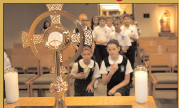
(above) Students from St. Joseph School enter the school's new St. Joseph chapel for Eucharistic Adoration. The school is located in St. Charles, MO. The sisters have served as administrators and teachers at the school since 2006.